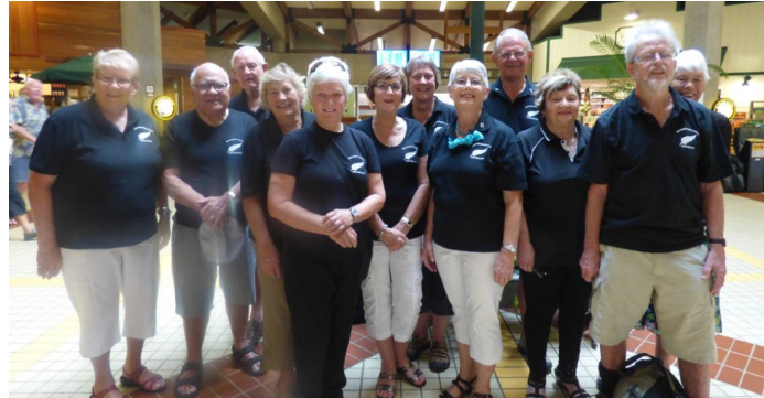
At Maui airport

This is the day that our group of 12 flew from Maui to meet the other 3 of our group and begin our Exchange with Honolulu Club